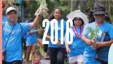
A&B employees, partners and their 'ohana participate in Koloa Plantation Days parade.

KOLOA, KAUAI IS THE LOCATION OF HAWAII'S 1ST SUGAR PLANTATION FOUNDED IN 1835