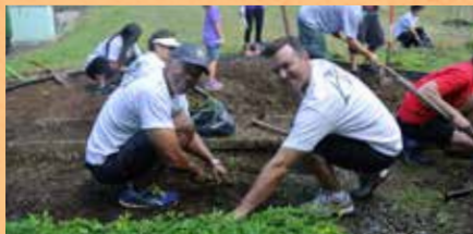
Volunteers weeded and planted a rainwater garden at Manoa Elementary.

Dozens of Alexander & Baldwin volunteers tackled campus beautification projects at Noelani and Manoa Elementary schools last year, investing their people-power in a community where the company put down roots with the 2016 purchase of nearby Manoa Marketplace. The volunteers planted a rainwater garden, painted walkways, scrubbed down a cafeteria and cleaned up the campus grounds at the two schools.