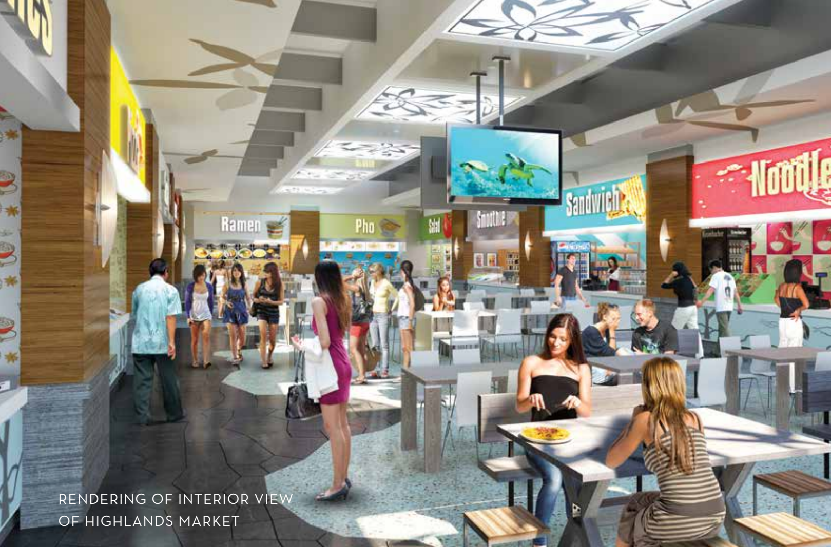
RENDERING OF INTERIOR VIEW OF HIGHLANDS MARKET