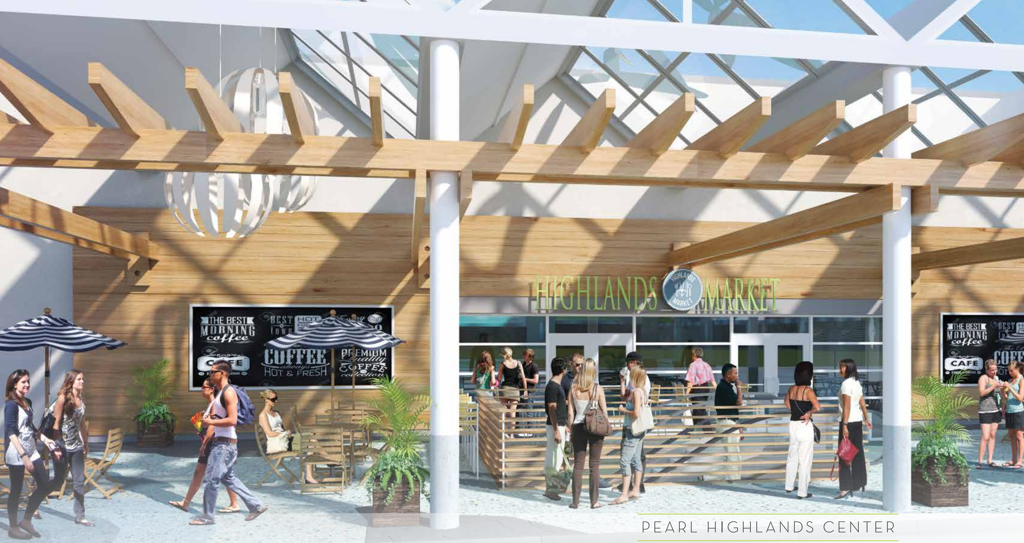
RENDERING OF EXTERIOR VIEW OF HIGHLANDS MARKET